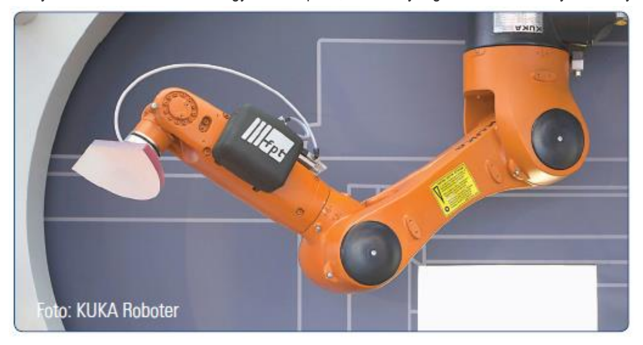
Thanks to special brakes on all axes, the compact KUKA robots deliver outstanding performance in every position. KOLLMORGEN found a good solution in cooperation with its brake supplier.

KOLLMORGEN'S AKM series of high-acceleration <u>permanent-magnet servo motors</u> are available in 28 housing and mounting combinations to facilitate compact machine designs. They also feature reduced energy consumption, extremely high control accuracy and very